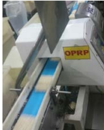
In metal detectors