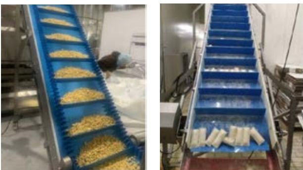
Containment of product (cashews)