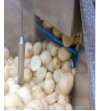
Unaffected by hydrolysis