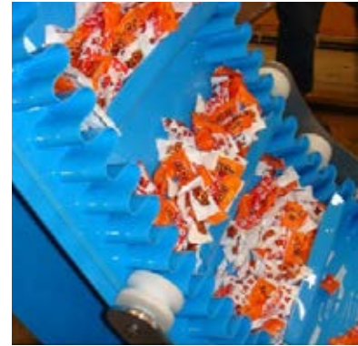
and even for packaging conveyors

Conveyors can be designed to conform to principles of Hygienic Design;