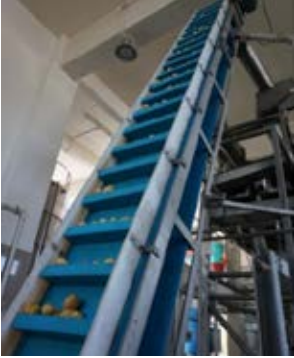
Raw material intake