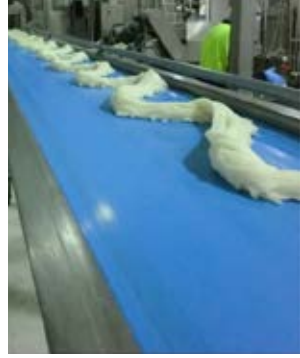
Raw product mass